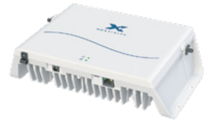
CEL-FI GO G51

Bringing the power of the macro 5G network indoors, CEL-FI GO G51 solves coverage challenges for the shorter range of mid-band 5G NR. The system delivers industry-leading signal gain up to 100 dB to overcome mid-band 5G NR coverage challenges that no other solution can. In addition to unmatched performance, GO G51 is compact, easy to use, and does not require manual configuration, making it easier than ever before for building owners to equip their buildings with 5G connectivity and ensure better voice quality, 5G data speeds, and fewer dropped calls. GO G51 is perfect for small- to medium-sized buildings, operator-approved, unconditionally network safe, and offers the flexibility to support various 2G/3G/4G and 5G cellular networks.